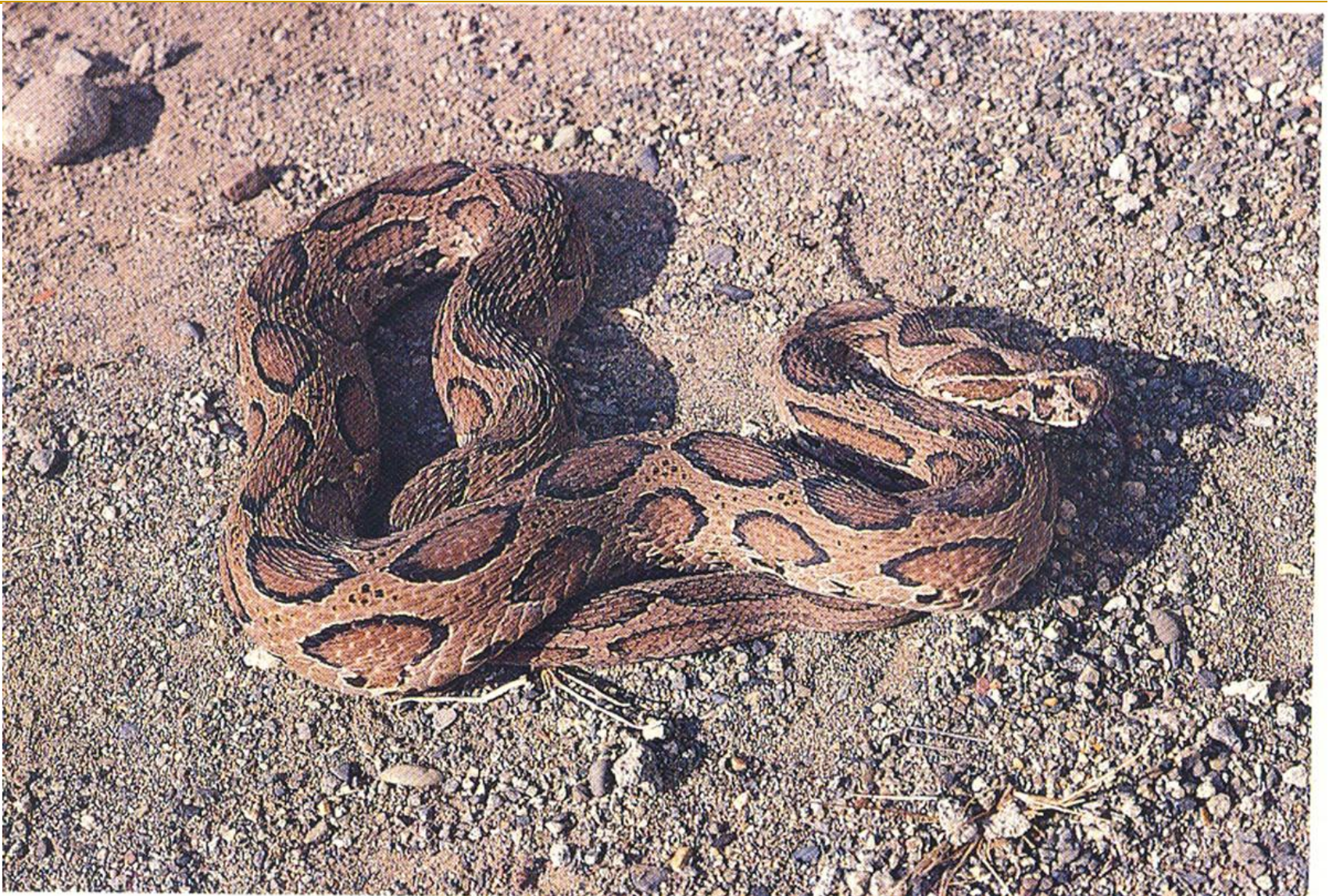
Russell's Viper- Thiophanes polanga